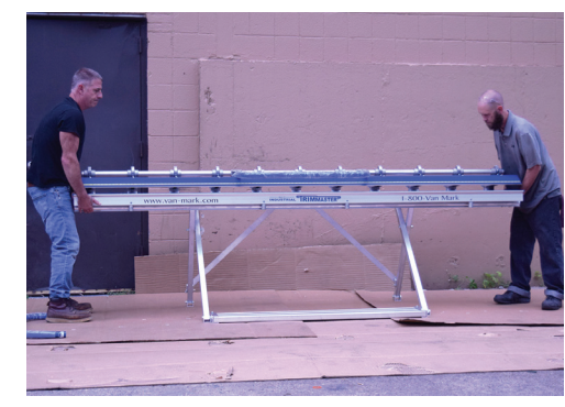
From the rear of the brake, remove fast pins from rear struts on base rails of brake and lower struts to meet rear legs of extreme stand. Insert fast pins to secure struts in place.