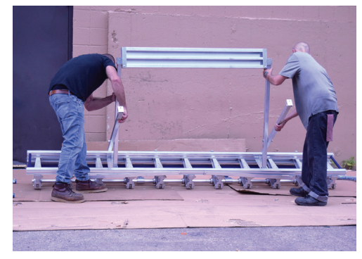
Insert back ends of top of extreme stand into rear brackets and secure with fast pins.