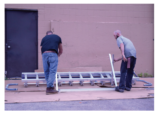
Unfold Extreme stand.