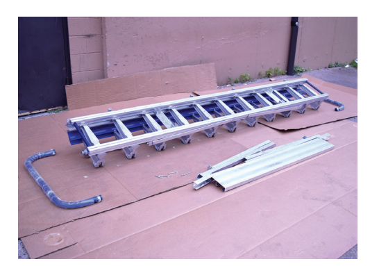
Set brake on back with rear of brake resting on the ground.

Installation is easiest if you place your Mark IV Brake on its back before installing legs. Once installed, right your brake to its normal operating position (See images below)