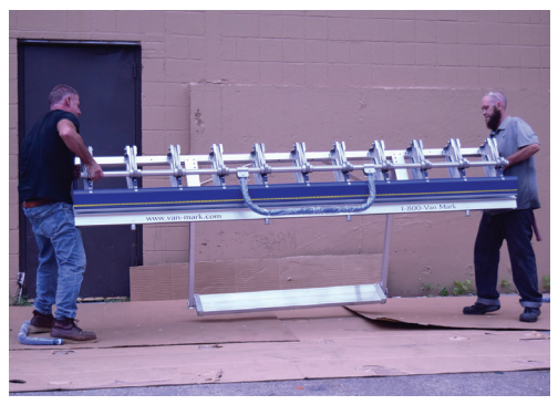
Use two people to lift brake and set up in normal operating position and pivot walk board at front of stand into flat position.