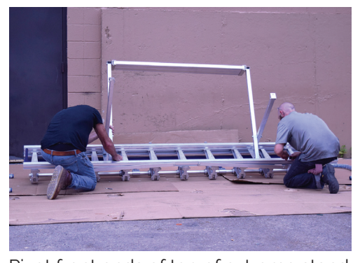
Pivot front ends of top of extreme stand into front brackets and secure with fast pins.